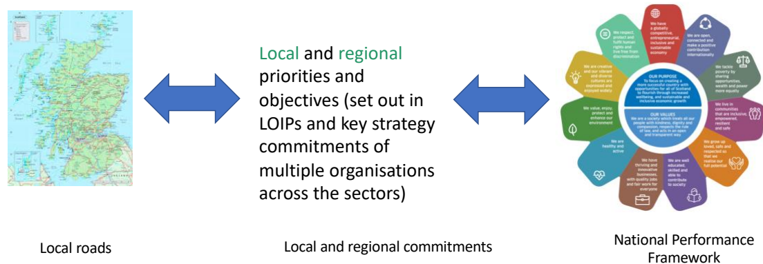
Figure 2: Aligning assessment of value with national, regional and local policy priorities

3.5 Scotland’s National Performance Framework (“NPF”) is a unique, nationwide articulation of policy aspirations for the country as a whole. It also forms a policy planning framework for a breadth of regional and local bodies, including local authorities as the managers of the local roads networks on the ground. These local priorities are captured in the Local Outcome Improvement Plans (LOIPs) agreed by partners in each local authority area. The research therefore focused its attention on measuring value for local roads in a way that was consistent with the NPF.