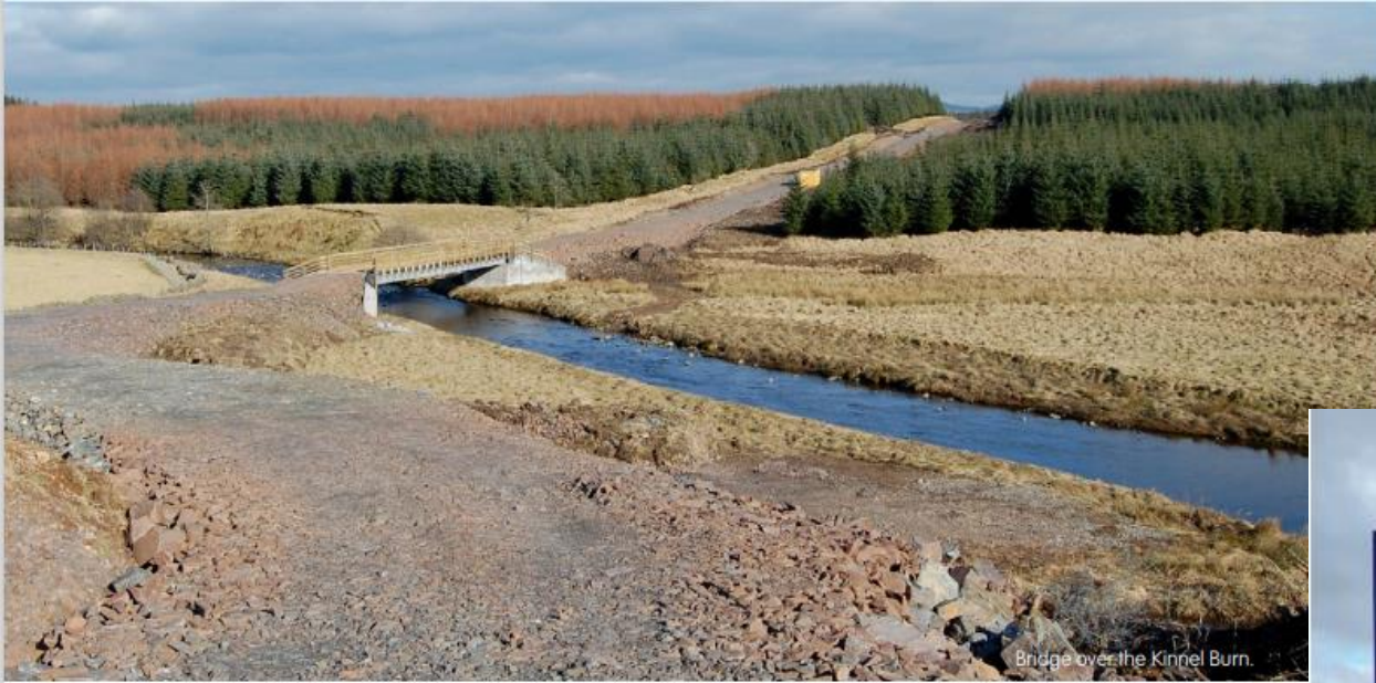
Bridge over the Kinnel Burn.